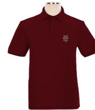
Short Sleeve Pique Embroidered Golf Shirt - Unisex MAROON Grade: 9-12