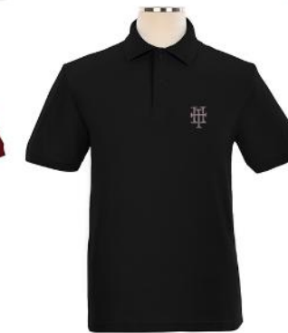
Short Sleeve Pique Embroidered Golf Shirt - Unisex BLACK Grade: 9-12