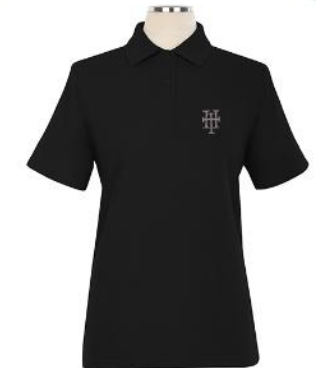
Short Sleeve Pique Embroidered Golf Shirt - Female BLACK Grade: 9-12