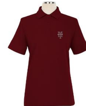
Short Sleeve Pique Embroidered Golf Shirt - Female MAROON Grade: 9-12